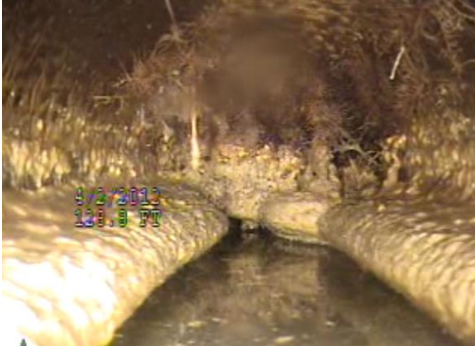
Figure 1: Buildup of grease causes a decrease in pipe diameter

A negative byproduct of food preparation and cleaning is fats, oils and grease (FOG). This can be created by dumping fried foods, dairy products, salad dressings, oils from cooking, etc. down the drain. This discharge can build up in a sanitary sewer lateral or main after it solidifies and create a blockage of the sewage that is on its way to be treated before being discharged back into the environment. The blockage in the sanitary sewer lateral or main can create sanitary sewer backups into properties as the sewage has no alternative but to surcharge up a sanitary sewer lateral. These products should be cooled, solidified and put into your trash can. Some evidence of the impact of FOG discharge into a sanitary sewer are found below: