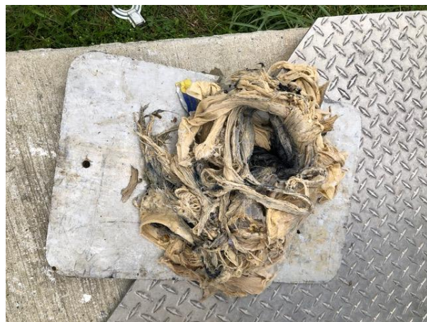
Figure 4: Materials pulled from a pump station in the City of Dover

The costs associated with these blockages and potential sewer overflow can cost in the thousands of dollars. Additionally, if the sewage is discharged into a water body, wildlife can be negatively affected. Please help protect our environment and infrastructure by preventing equipment and pipes from blockages and expensive clean-up costs.