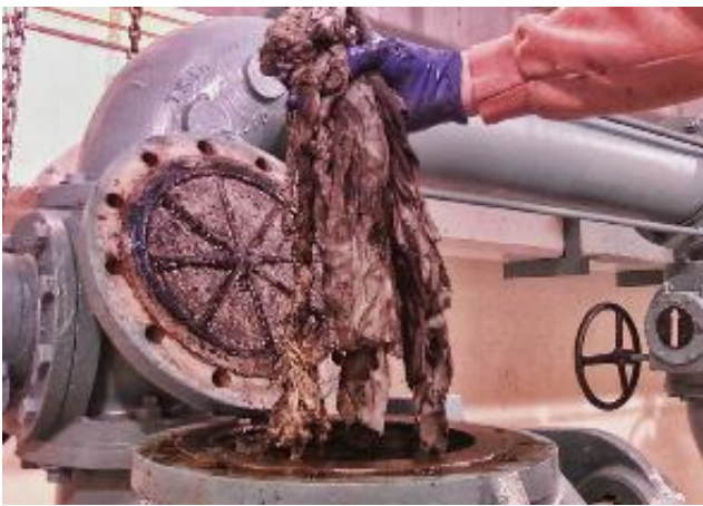
Figure 1: Wipes, Paper Towels being pulled out of a sanitary sewer

Other items that should never be sent down the toilet or drain include paper towels, wipes, ear cleaning swabs, dental floss, feminine hygiene products or disposable diapers. Even if the item is marked “FLUSHABLE”, never put them down the toilet. All of these products belong in the trash can and can damage the sanitary sewer system. Along with FOGs, these items can create severe blockages as well as putting strain on our pump stations, which can result in a sewer backup and contaminate the environment. Some evidence of these items and the impact on the sanitary sewer are found below: